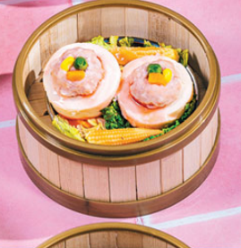
← THE DUO ON EGG TOFU $ (2) $6.9 STEAMED PORK AND CHICKEN MINCE AND EGG TOFU.