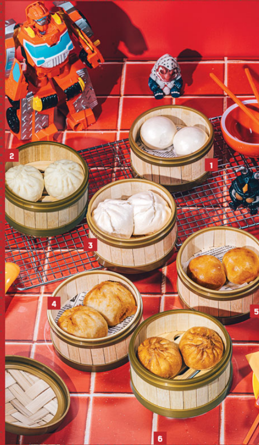
1. STEAMED CUSTARD BUN (2) $7.9