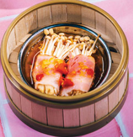
← BACON ENOKI IN CHILLI LIME SAUCE (2) $8.9 STEAMED ENOKI MUSHROOM WRAPPED WITH BACON IN CHILLI LIME SAUCE