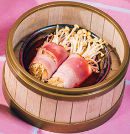
← BACON ENOKI IN RED GRAVY $ (2) $6.9 STEAMED ENOKI MUSHROOM WRAPPED WITH BACON IN RED GRAVY.