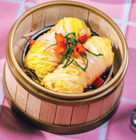
← THE TRIO IN WOM BOK $ (2) $7.9 STEAMED MIXED OF PORK CHICKEN AND PRAWN MINCED, WRAPPED WITH WOM BOK IN RED GRAVY.