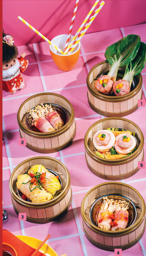
1. THE TRIO ON GREEN BED $ [2] $6.9

STEAMED MIXED PORK CHICKEN AND PRAWN MINCE, BOK CHOY IN RED GRAVY.