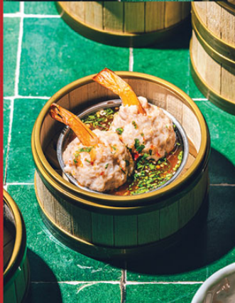
← THE DUO PRAWN CHILLI LIME $ [2] $8.9 PRAWN WITH PORK AND CHICKEN MINCE IN CHILLI LIME SAUCE.