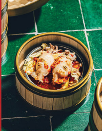
← STUFFED SQUID WITH CHILLI LIME $ [2] $7.9 STEAMED SQUID STUFFED WITH PORK AND CHICKEN MINCE IN CHILLI LIME SAUCE.