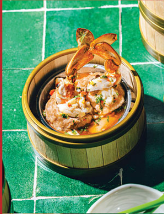
← CRAB ROWING WITH CHILLI LIME [2] $9.9 STEAMED CRAB PADDLE-LEG WITH PORK AND CHICKEN MINCE IN CHILLI LIME DRESSING.